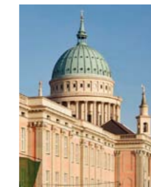
New Landtag - St Nicholas Church (17)