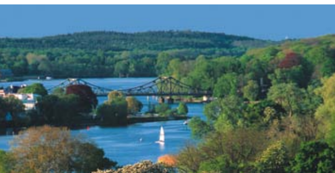
Gliencke Bridge connects Potsdam and Berlin. (3)