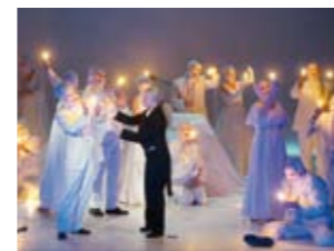
Potsdamer Winteroper (32)