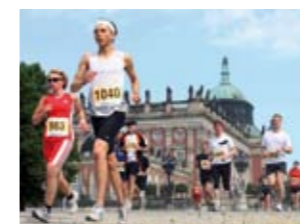
Running event "Schlösserlauf" (37)