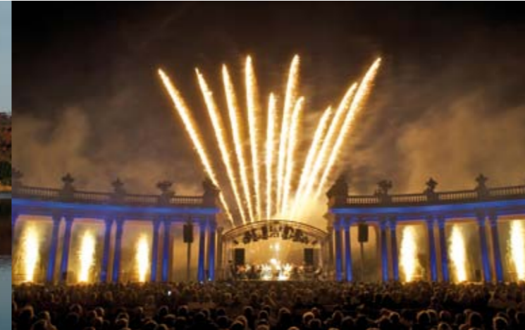
Musikfestspiele Potsdam Sanssouci (30)