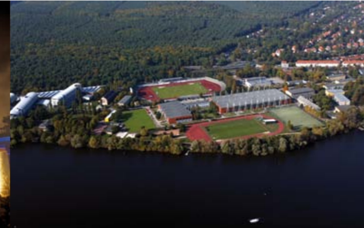
Sports and leisure park "Luftschiffhafen" at Templiner See (34)