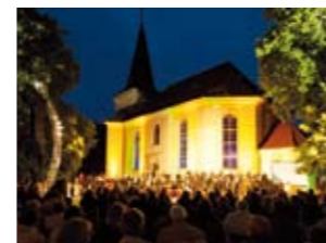
Classical concert in Babelsberg (33)

The historic city ensembles, the palaces and gardens of Potsdam are well worth a visit. Cultural highlights of the season are the Potsdamer Tanztage International Festival for Contemporary Dance and many open air concerts in historical settings. The wide range of cultural offers includes venues like Nikolai Concert Hall, cabarets, museums, and galleries. The Schiffbauergasse quarter with the Hans Otto Theatre and a multifaceted, independent scene round off Potsdam's cultural diversity.