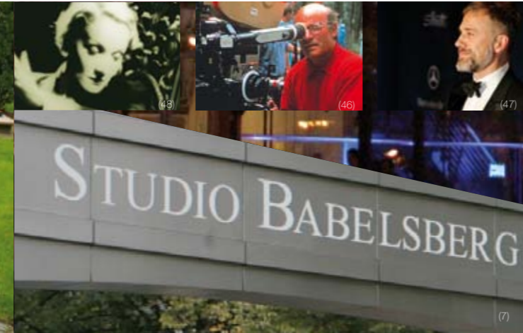
Studio Babelsberg is a film location for German and international productions. Film star Marlene Dietrich (top left), Oscar prize winner Volker Schlöndorff (top middle), Actor Christoph Waltz wins the Bambi award (top right) (7)