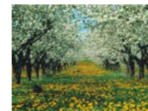
Fruit plantation in the north of Potsdam (40)