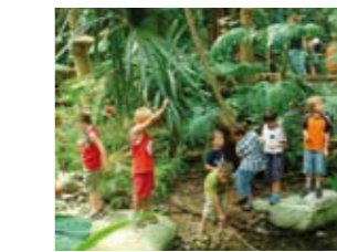
Biosphere Potsdam (22)