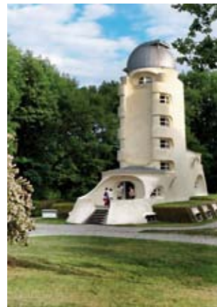
Einstein Tower on the "Telegrafenberg" (5)