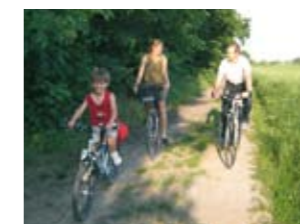
Bike tour through the Havel landscape (41)

North of the parks of Potsdam, the fields of the "Bornimsche" or "Lennésche Feldflur" mark the transition from the urban landscape to the countryside. These rural areas of the state capital Potsdam include the open fields and meadows, parks, and fruitgrowing regions of Bornim and Grube, Neu Fahrland, Fahrland, Satzkom, Marquardt, Kartzow, and Uetz-Paaren. Farmers and gardeners offer their products here. The Sielmann foundation's Döberitzer Heide was used for military purposes for more than 100 years. Today it is a biotope for rare plants and animals. Horticulture paths guide visitors through the charming area north of Potsdam. Boat and bike tours starting in Potsdam's city centre lead to the district Sacrow with the Church of the Redeemer on the castle grounds. Other destinations such as Werder/Havel, Petzow, and Ferch are also conveniently situated. Sights in the rural areas include reconstructed castle and park grounds, old churches, mansions, and monuments such as Einstein's house and Caputh Palace.