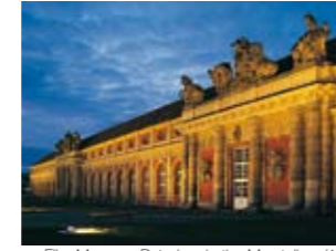
Film Museum Potsdam in the Marstall (10)

Rich in tradition, the film studios in Potsdam-Babelsberg have developed into a modern media and high-tech centre. The film location of stars like Marlene Dietrich today produces national as well as international motion pictures – prize winners in Berlin, Cannes, and Hollywood. Famous stars and renowned directors work here in front of or behind the camera. The impressive building of the Film University Babelsberg KONRAD WOLF within the premises of the media city sets standards for the future of Potsdam. In the "Marstall", the historic horse stables of Prussian kings in the city centre, the Film Museum Potsdam presents interesting exhibitions, particularly on German film history. Potsdam often becomes a shooting location – Potsdam and film belong together. This is demonstrated every year at the international student film festival "Sehsüchte".