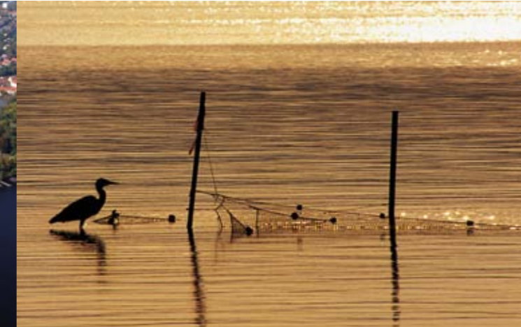
Lake "Templiner See" (38)