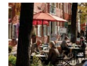
In the Dutch Quarter (44)