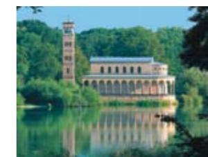
Church of the Redeemer in Sacrow (39)