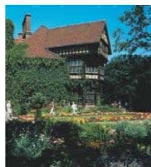
Cecilienhof Palace in the New Garden (28)

Frederick II commissioned his architect Knobelsdorff to build Sanssouci Palace as his summer residence, which then was built from 1745-1747. The park area grew over a period of more than a hundred years with ever-changing views of prestigious ensembles such as the New Palace or fanciful buildings such as the Chinese House. Garden architect Lenné shaped parts of the park into an English landscape garden that also features Italian elements such as the Roman Baths and Charlottenhof Palace, designed by Schinkel. The Belvedere on Klausberg, the Orangery Palace, the New Chambers, and the antique scenery of the historic ensemble on Ruinenberg are partly accessible to visitors after extensive reconstruction. www.spsg.de