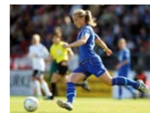
Football "1. FFC Turbine Potsdam" (36)