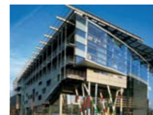
Film University Babelsberg KONRAD WOLF (8)