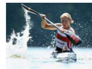
Olympiasiegerin Katrin Wagner-Augustin (35)