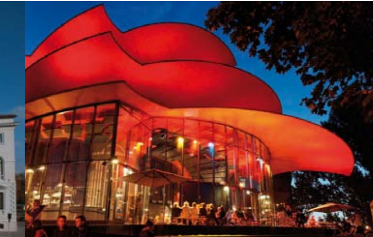
Hans Otto Theatre (20)