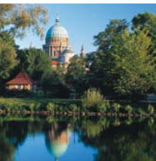
Along Friendship Island (2)