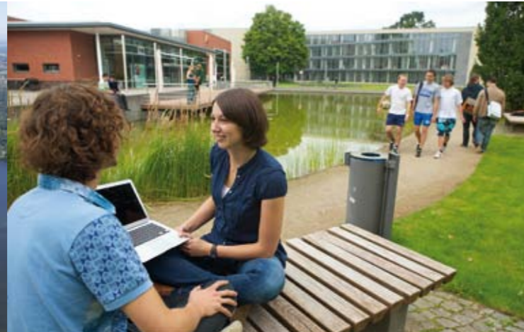
Hasso Plattner Institute in Potsdam-Babelsberg (4)