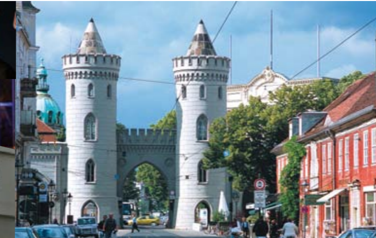
Neuen Gate next to the Dutch Quarter (11)