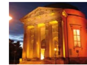
French Church next to Bassinplatz (12)