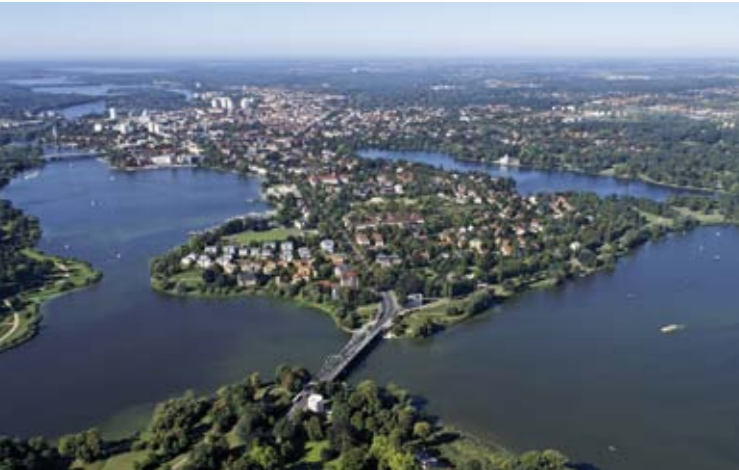
State Capital Potsdam next to Berlin (1)