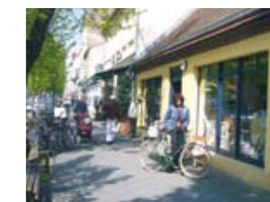
Karl-Liebknecht-Straße in Babelsberg (45)

A shopping stroll through the historical city centre of Potsdam has a unique appeal. Lively street cafés, elegant boutiques, art and antique shops, and imaginative restaurants make for an inspiring shopping experience. The market bustle at Nauen Gate attracts many citizens and visitors. Small craft shops in the Dutch Quarter offer many homemade products manufactured with loving care. Experience Potsdam at its best during the popular festival "Potsdamer Erlebnisnacht" that takes place on the last Saturday in July.