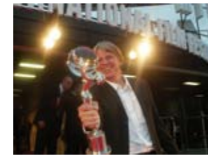
Director Andreas Dresen from Potsdam (9)