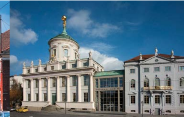
Potsdam Museum – Forum for Art and History in the Old Town Hall on Alter Markt (16)