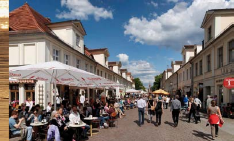
Brandenburger Straße (42)