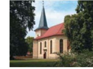
Friedrich Church near Weberplatz (14)

Experience European history in Potsdam. In 1685 the "Great Elector" opened the Margraviate of Brandenburg to Huguenots with the "Tolerance Edict of Potsdam". Later, immigrants from other parts of Europe followed. The Dutch Quarter, the Russian Colony Alexandrovka, the Bohemian Weavers' Quarter, the Swiss Village Nattwerder, and the many churches and Italian style villas give the historic city an international atmosphere.