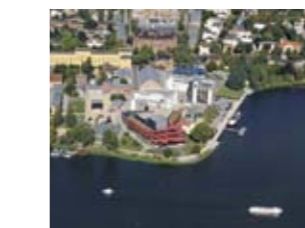
Cultural district Schiffbauergasse (21)