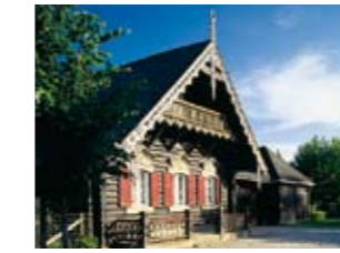
UNESCO World Heritage Russian Colony (13)