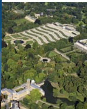
Church of Peace and Sanssouci Palace (26)

The famous palaces and gardens of Potsdam are treasures of a cultural landscape, which has developed over three centuries. The annual music festival "Musikfestspiele Potsdam Sanssouci" that has been held since 1954 is a highlight in the cultural calendar.