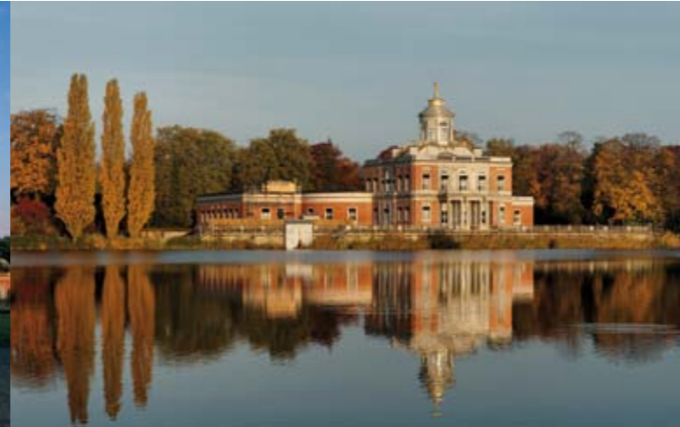
New Garden and the Marble Palace at "Heiliger See" (27)