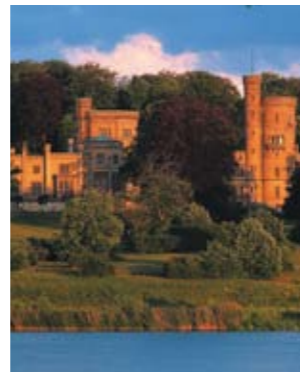
Babelsberg Palace at "Tiefer See" (29)