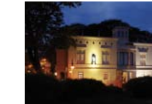
Villa Schöningen at Glienicke Bridge (23)

The 2001 national garden show triggered a powerful surge in the city's development. Former military exercise grounds were transformed into the public "Volkspark" and the tropical botanic garden "Biosphere". The scenic island "Freundschaftsinsel" and other new locations by the river invite guests to enjoy long walks. The fields of the "Feldflur" were reconstructed using the historical plans of ingenious landscape designer Lenné. The Crown Estate Bornstedt was also rebuilt. The panoramic view from the observation towers of the Belvedere on Pfingstberg is a genuine highlight. The permanent contemporary art exhibition at Villa Schöningen is dedicated to the situation at the border before the fall of the Wall in 1989. The district Schiffbauergasse has developed a profile that is rich in contrast with the new Hans Otto Theatre, the restored historical buildings for the art scene, and interesting new architectural solutions of the international corporation Oracle and the design centre of Volkswagen.