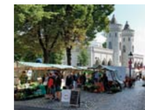
Market at Nauen Gate (43)

North of the parks of Potsdam, the fields of the "Bornimsche" or "Lennésche Feldflur" mark the transition from the urban landscape to the countryside. These rural areas of the state capital Potsdam include the open fields and meadows, parks, and fruitgrowing regions of Bornim and Grube, Neu Fahrland, Fahrland, Satzkom, Marquardt, Kartzow, and Uetz-Paaren. Farmers and gardeners offer their products here. The Sielmann foundation's Döberitzer Heide was used for military purposes for more than 100 years. Today it is a biotope for rare plants and animals. Horticulture paths guide visitors through the charming area north of Potsdam. Boat and bike tours starting in Potsdam's city centre lead to the district Sacrow with the Church of the Redeemer on the castle grounds. Other destinations such as Werder/Havel, Petzow, and Ferch are also conveniently situated. Sights in the rural areas include reconstructed castle and park grounds, old churches, mansions, and monuments such as Einstein's house and Caputh Palace.