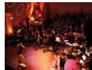
Concert at Nikolai Concert Hall (31)

Outstanding landscape designers and architects such as Lenné, Pückler-Muskau, Schinkel, and Persius created a comprehensive work of art of exceptional beauty. The view axes laid out by Lenné in the romantic park on the Havel river have been restored. The neo-gothic Babelsberg Palace, former summer residence of Emperor Wilhelm I, offers attractive views of the Flatow Tower and Glienicke Bridge. Before the fall of the Berlin Wall in 1989, this bridge between Potsdam and Berlin symbolized the division of Europe.