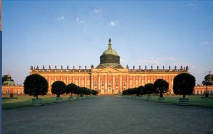
New Palace in Sanssouci Park (24)